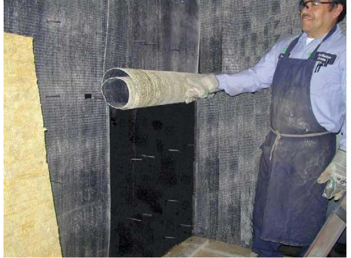
(2) INSTALL 3880-10 FLINT-LASTIC