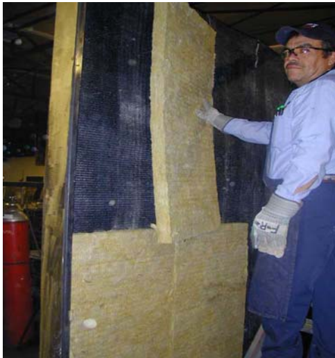
(3) INSTALL 2648-00 THERMO FIBER