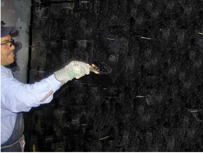
(1) APPLY 3880-02 COATING