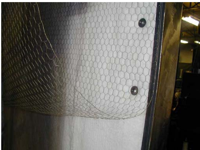
(5) INSTALL 2400-00 SS HEX MESH WIRE